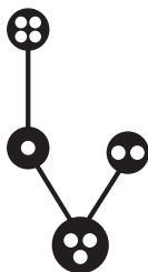
Figure 2.1. A finite topological space with 10 elements and 4 equivalence classes